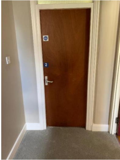
Internal colour contrast